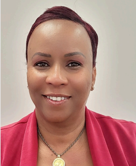
Carmen Lake | Sint Maarten